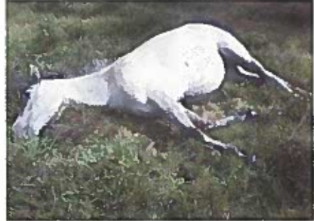
The pony it hit