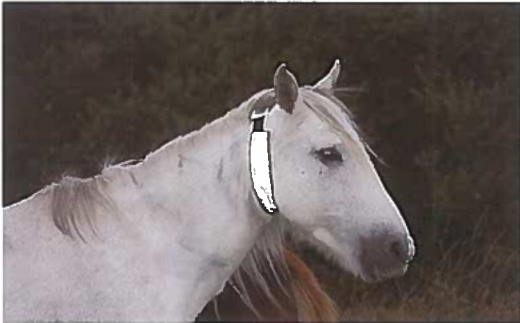
Pony wearing reflective collar

You can help by driving especially carefully when you are in the Forest and by passing the messages contained in this leaflet to your friends and family.